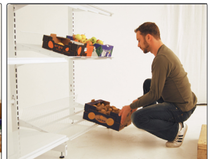
With part of the box supported on the edge, tilt the remaining part up and slide the entire box into place - instead of lifting it.