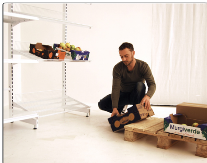
Use the pallet and then the floor to support the box while sliding/pulling the box instead of lifting it.