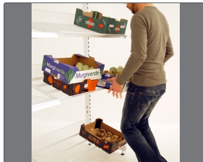
Turn the box so the long side faces towards you, then lift the box onto the front edge of the shelf.