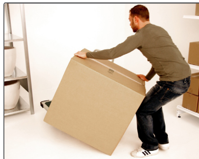
Push and turn the product until the part of it that is tipped rests on the platform.