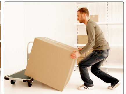
Then push the product into place on the platform trolley - use the base as a support instead of lifting.