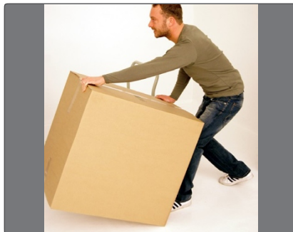
Park the platform trolley close to the product - grab hold of the product and tip it.