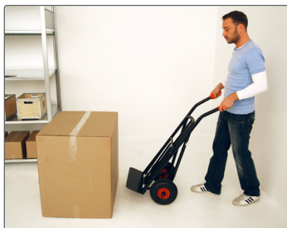
Position the sack trolley next to the long side of the box.