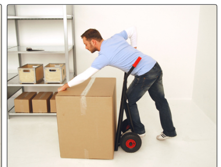
Block with your foot and pull the box into place - tilt the sack trolley to balance the load and you're ready to move the box.