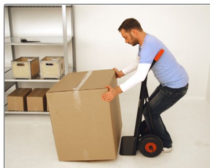
Tilt the box and then push the ledge of the sack trolley under it.