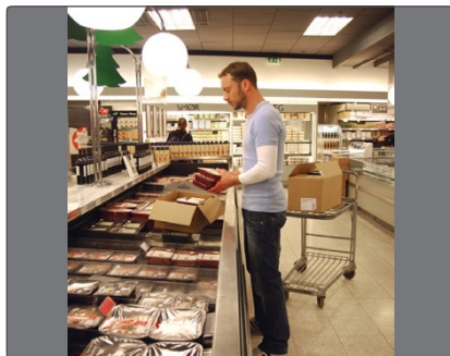
Ensure a comfortable reaching distance.