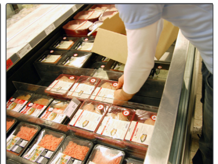
Place the products at the front of the display case, and then push the products into place instead of lifting them.